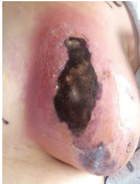
Fig. 1. Initial photograph in the emergency department. A 31-year-old female patient presented to the emergency department with left breast skin color change, pain, swelling, and discharge.

We experienced and report here a case in a young female patient of primary NF of the left breast that was successfully treated and reconstructed. To our knowledge, this is a rare case of a patient without previous trauma that spontaneously developed NF.