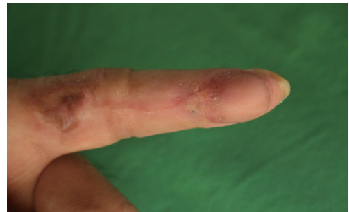
Fig. 3. Two months after the operation. At two-month follow-up, the surgical site had completely healed, with no limitation of motion.

pulse oximetry comes into effect so instantly that full-thickness burn is already caused before patients recognizes and removes the pulse oximetry [3]. Extreme caution is required for removal of pulse oximetry before MRI examination.