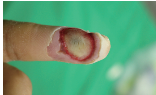
Fig. 2. Third-degree contact burn. A third-degree contact burn occurred on the distal phalanx of the left index finger. Eschar formed on the site of the injury.